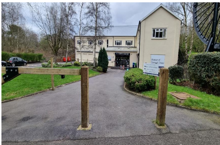
Pedestrian access with no step to main entrance