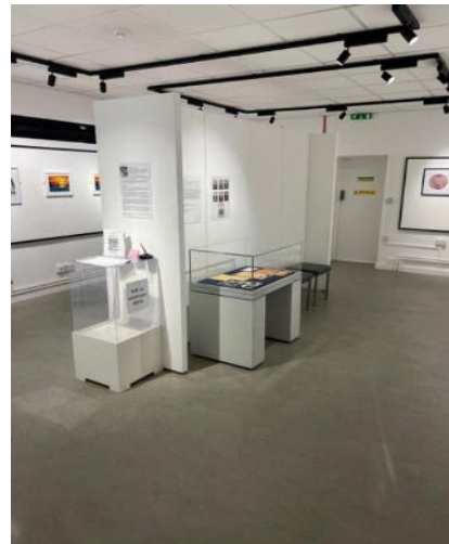
Temporary Exhibition Gallery