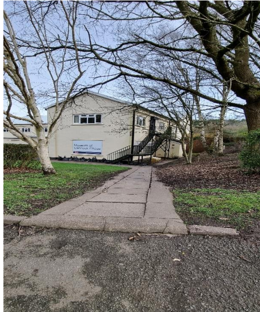
Path from main car park with step