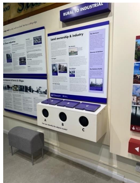
Local history galleries