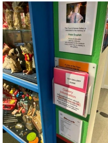
Guides to the Toy Gallery