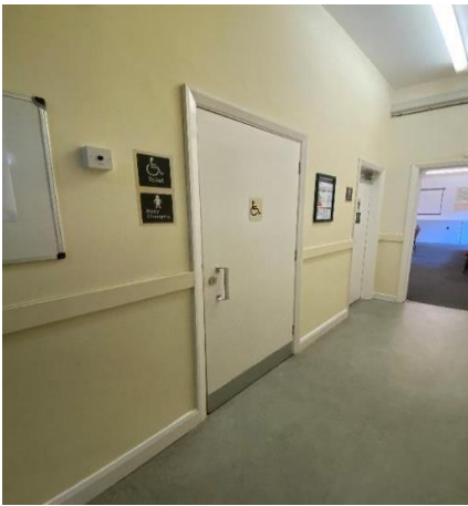
Accessible Toilet Entrance